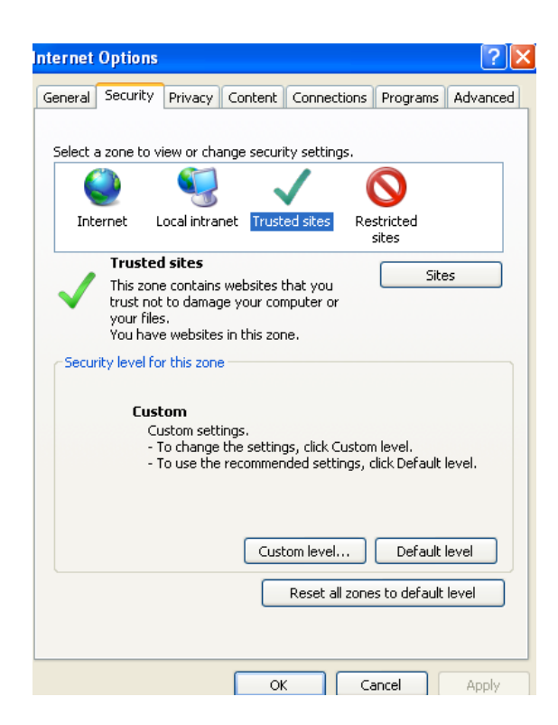
Click on Sites